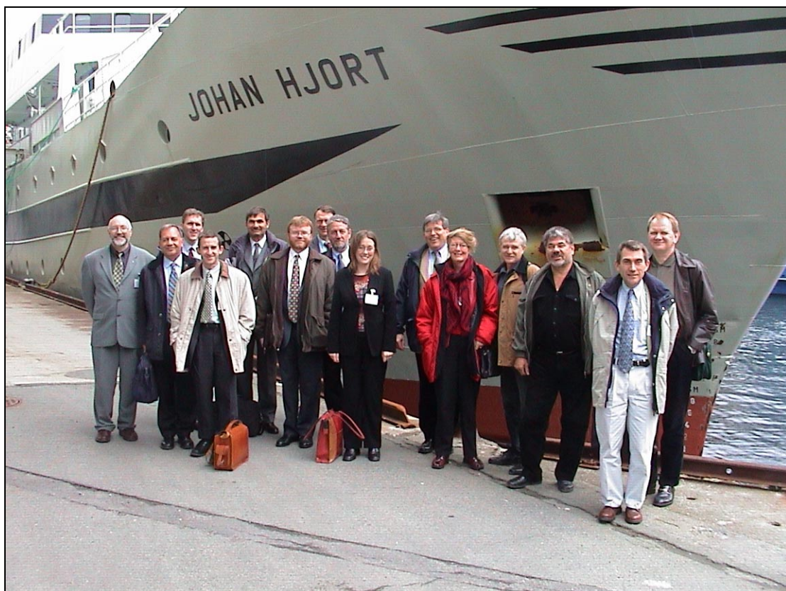
ERVO 2002. Bergen, Norway