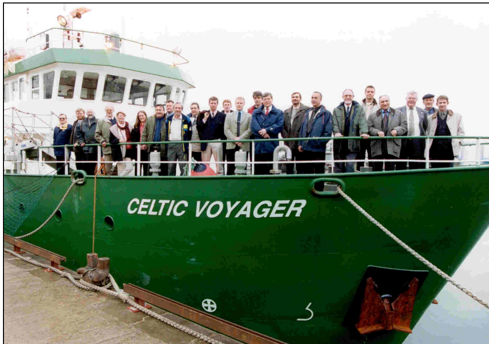
ERVO 2000. Galway, Ireland