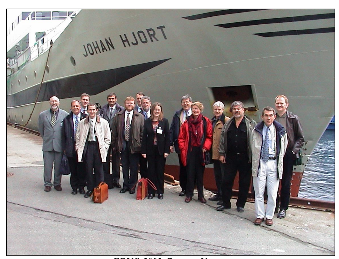
ERVO 2002. Bergen, Norway