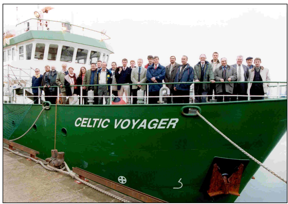
ERVO 2000. Galway, Ireland