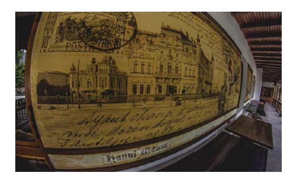
Address: Str. Franceza nr. 62-64, Bucharest

It is located in the heart of the city, in the Touristic Old Centre, two steps from Unirii Square. Hanul lui Manuc (Manuc's Inn) is a true royal inn and it is more than a restaurant. For two centuries, it has shown the pulse of the capital of Romania, operating as a restaurant, hotel, café, wine cellar and even show scene. Although Manuc's Inn has been subject to repeated restorations, its essential structure has remained intact, being one of the last Caravan Serai buildings in Europe.