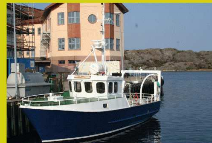
R/V Oscar von Sydow

Oscar von Sydow, length 12 metres, is equipped for marine research and education during day-trips in inshore waters. The vessel holds a Special Purpose Certificate for 25 people.