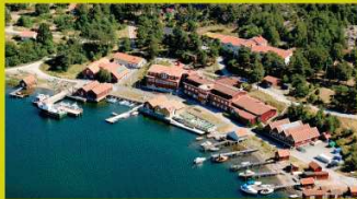
The Lovén Centre Tjärnö

The Sven Lovén Centre for Marine Sciences is the marine infrastructure organisation of the University of Gothenburg. The Lovén Centre comprises research vessels and two stations for research, education and public outreach, located in unique environments on the west coast of Sweden: Tjärnö by the Koster fjord and Kristineberg by the Gullmar fjord.