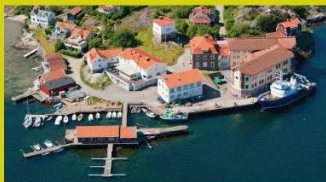
The Lovén Centre Kristineberg