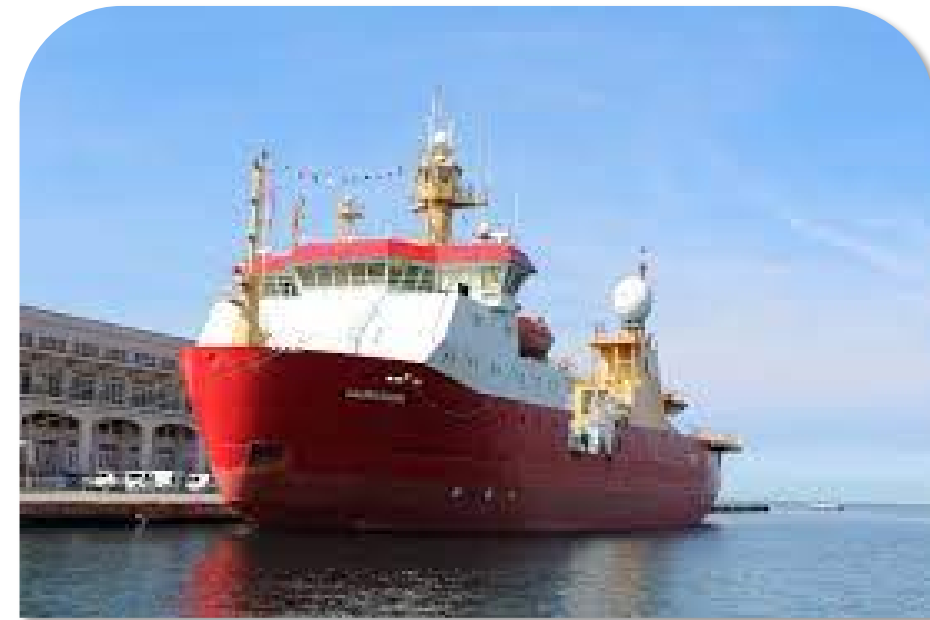
The ice-breaker RV Laura Bassi

An extensive instrumental upgrade to the vessel is currently underway, with the contribution of CNR, to convert it into a modern multipurpose scientific platform that can serve different scientific communities working on various research fields, including physical, chemical and biological oceanography, paleoceanography, geophysics, marine geology and atmospheric