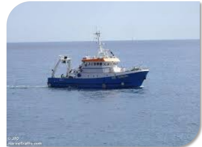
RV Thetys II